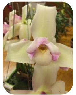
Lycaste "Island of Toka"