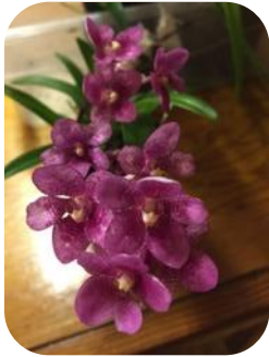
Sarc. Bunyip "Big Edge" x Sarc. Zoe 'Pink Edge'