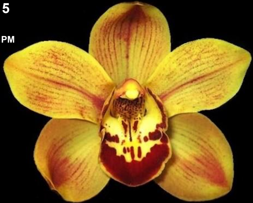
Cym. Tower of Fire 'Flambe'

San Mateo Garden Center 605 Parkside Way San Mateo, CA 94403