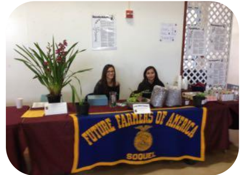
Soquel High Students man their booth